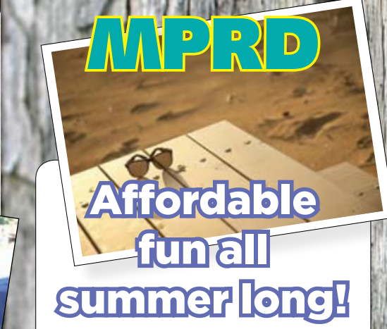
Diamond Lake Beach